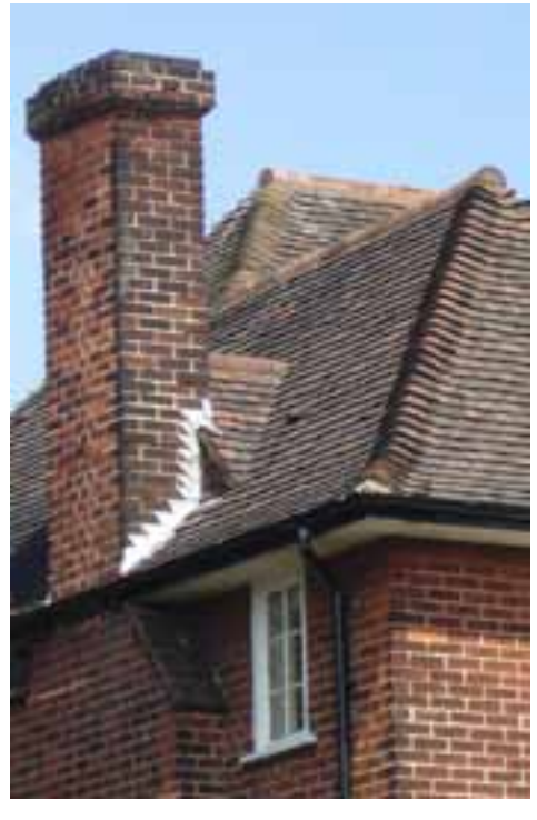
06 Chimneys are often prominent and significant parts of historic buildings