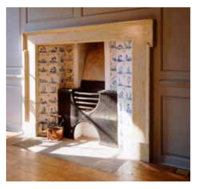
03 An 18thC cast iron grate in a fireplace at the Great Yarmouth Row Houses

The fabric of chimneys in historic buildings and debris that accumulates in disused chimneys can be of archaeological importance. Care should be taken not to lose historic fabric during the opening up of old flues or during the process of making alterations to flues in historic buildings. Listed Building Consent may also be required.