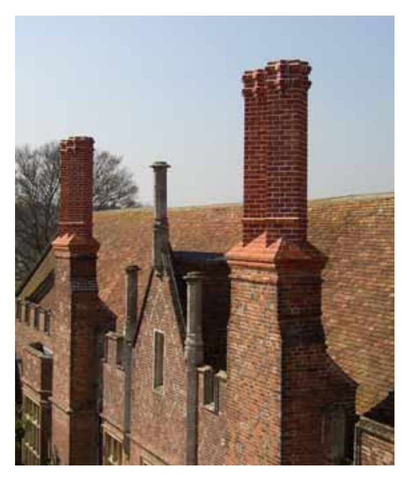
O5 Chimneys are often prominent and significant parts of historic buildings

A person registered by Ascertiva Group Ltd , Association of Plumbing and Heating Contractors (Certification) Ltd, Benchmark Certification Ltd, Building Engineering Services Accreditation Ltd, ECA Certification Ltd, HETAS Ltd, NAPIT Registration Ltd or Oil Firing Technical Association Ltd.