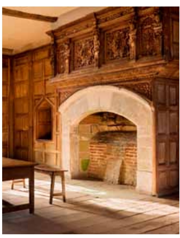
02 Fireplace in the solar at Stokesay Castle with I7thC carved overmantel

As comfort standards improved and buildings became more compartmentalised, smaller fireplaces were required in more parts of the building. This trend was aided by the growing availability of coal in the 17th and 18th centuries, especially in urban areas. Coal burns more efficiently than wood, providing more heat from a smaller fire. Coal fires benefit from being in a grate that allows more oxygen to reach the burning coal.