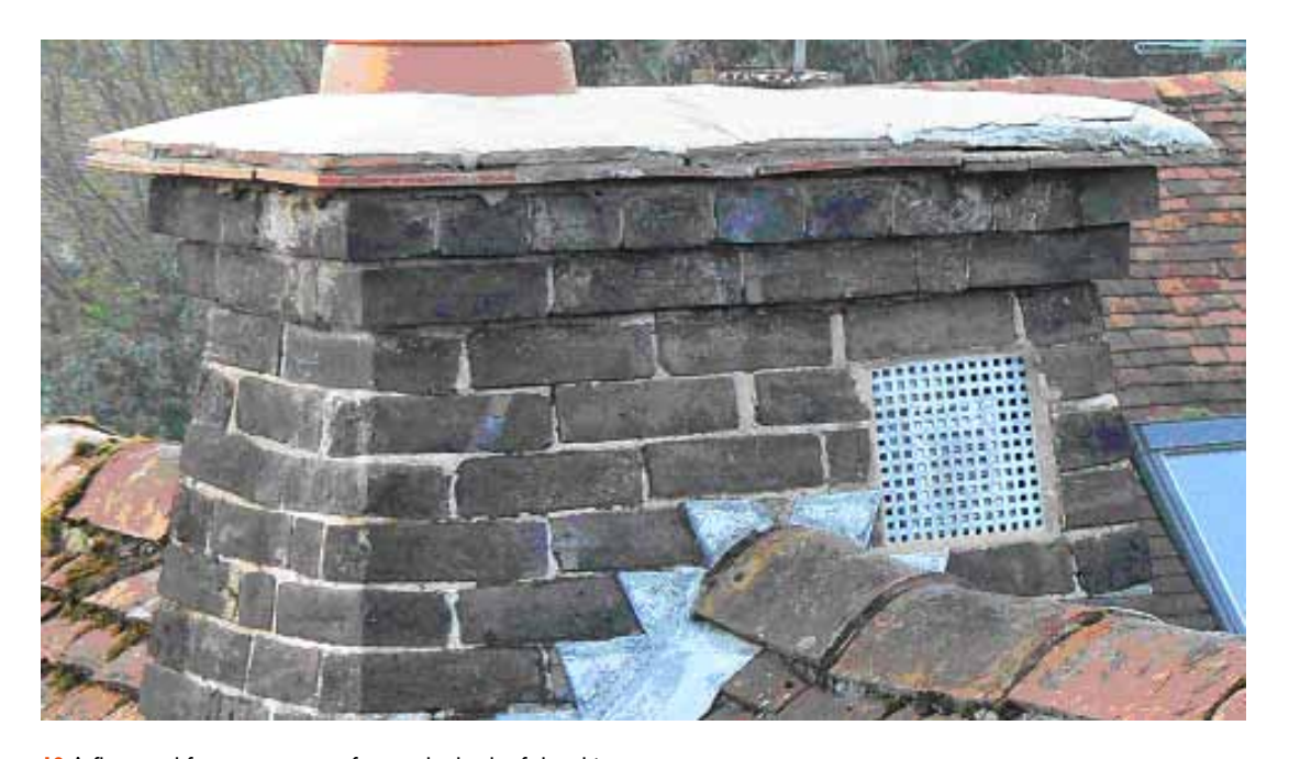
10 A flue used for an extractor fan on the back of the chimney.

All disused flues require regular maintenance. The greatest risk is from birds' nests or other debris entering the chimney from above, or from building debris (old parging or broken withes) from the flues themselves. Either form of debris can block flues in unexpected places, leading to damp, smells, staining and other problems. The simplest way to check for and clear such debris is to have the disused flues swept.