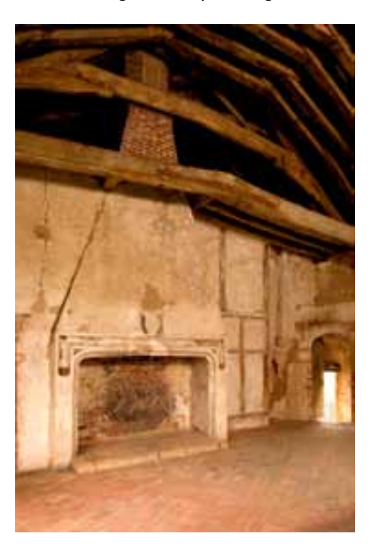
01 Fireplace in the first floor bedchamber at Castle Acre Priory

The earliest brick chimneys were built over traditional open hearths. Wood consumption was high, as most of the heat went up the chimney with the smoke, while cold air was sucked in from the outside through the leaky building fabric.