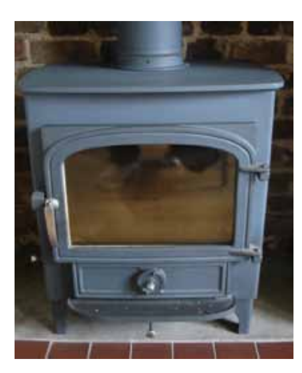
09 Stoves burn fuel much more efficiently than open fires and cause fewer draughts.

Room heaters or stoves must be installed by a 'competent person', e.g. an engineer registered with HETAS for solid fuel, OFTEC for oil or Gas Safe for gas. The flue gas temperatures from a room heater can be significantly more than from an open fire so care is needed to reduce the risk of fire or heat damage. A flue liner will always be required; and if a flexible metal liner is used it should be double skinned. Some chimneys may not be capable of accommodating an adequate liner and so will be unsuitable for a room heater.