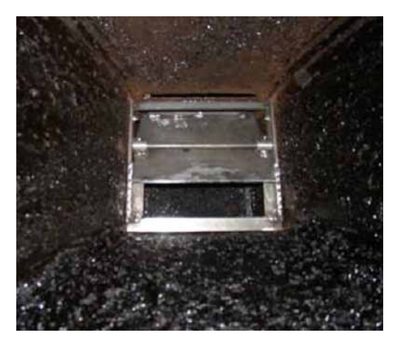
07 A damper fitted within a flue.

A chimney for an open fire will be a cause significant draughts when it is not in use. A good remedy for this is to fit a damper, which can be installed either in the throat of the chimney, the flue, or at the top of the chimney. The best types are easily opened and closed using a handle that also indicates the position of the damper flap. Dampers should not block all the air entering the chimney as a small permanent flow is necessary to ventilate the flue when it is not in use. If a gas appliance is to be used, any damper must be fixed in the permanently open position.