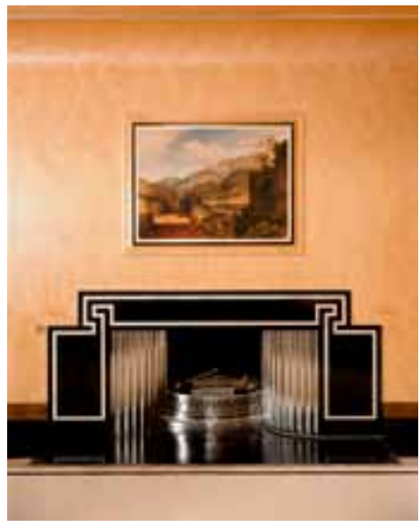
04 An inter-war fireplace at Eltham Palace