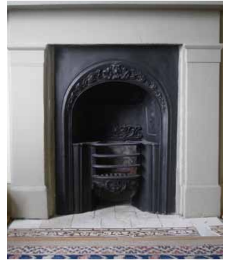
08 Cast iron fireplaces such as this one often incorporated built in dampers to restrict draughts when the fireplace was not in use.