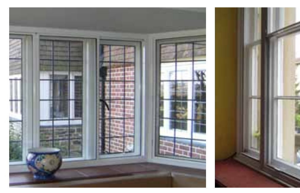
{\color{black} 05} Horizontal sliding secondary sashes used with a leaded light window