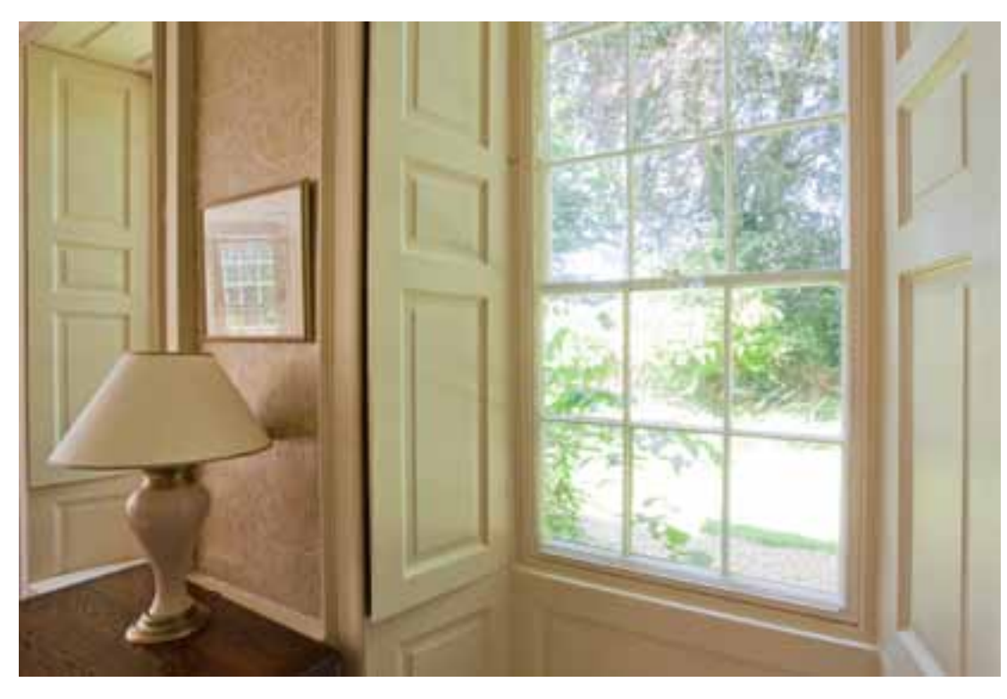
14 Slim profile secondary glazing used in conjunction with opening shutters