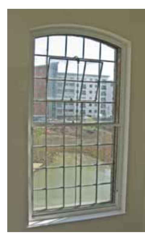
II Vertical sliding secondary sashes used with a cast iron window

The design of the original window can be used to determine the style of the secondary glazing to be installed. The dimensions of the primary window are fixed but the secondary glazing can be designed into manageable sized units.