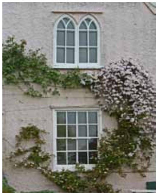
16 secondary glazing added to these windows makes no visual impact externally