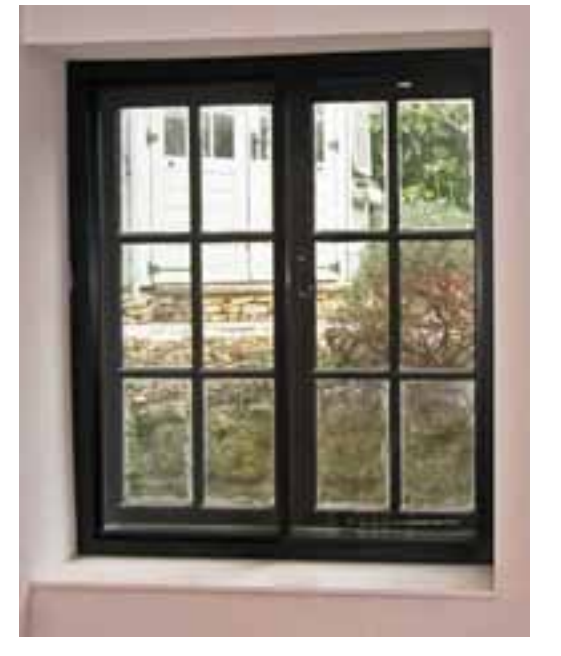
15 A secondary glazing unit colour matched to the primary window for minimal impact

Secondary glazing can be visually intrusive externally and internally if badly designed. To minimise the visual effect of secondary windows externally, try to make sure the secondary glazing is not smaller than the glazed area of the existing window. Try to place any divisions in the glazing behind the window meeting rails or glazing bars. The flat reflections of modern glass within secondary glazing can be minimised by using anti-reflective glass.