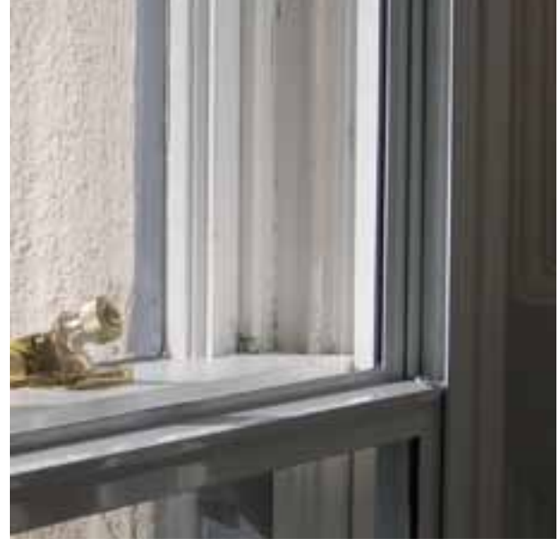
03 Draught-proofing should be the first option to consider for improving the energy efficiency of windows in an older building