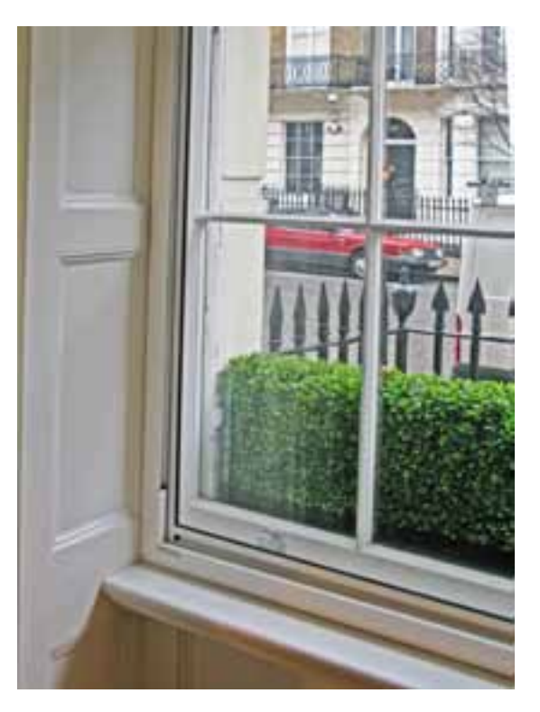
12 Secondary glazing carefully incorporated with window reveal panelling