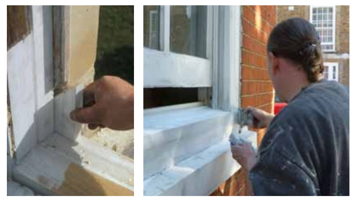
02/03 Before starting any upgrading work such as draught-proofing or the addition of secondary glazing, assess what repairs are needed to make the windows fully operational.

Traditional timber and metal windows can almost always be repaired, even when in quite poor condition and normally at significantly less cost than complete replacement. The timber used in the past to make windows was of a high quality and very durable. Many Georgian and Victorian windows are still in place today whereas modern windows can need replacement after only 20 years. Repairing windows is the best way of maintaining the visual character and architectural significance of a building's elevation and can add to its value.