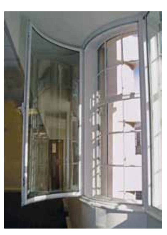
10 Special secondary glazing units can be made