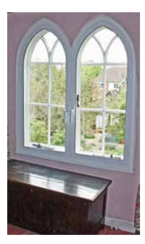
09 Curved headed secondary casements

There are limitations but it is possible to shape all styles of secondary glazed units to the shape and style of the external window.