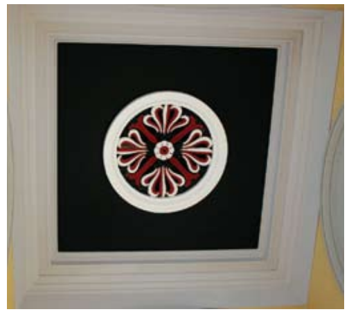
Closed up air vent in public building.

Attics are often draughty spaces and where steps are understandably taken to improve insulation but at the cost of reducing air flow. Although this is unquestionably beneficial in energy terms, some thought must be given to ensuring adequate moisture dispersal. Insulation measures should ensure roof voids are adequately ventilated and ventilation from the lower parts of the building, mainly from the gaps between the inner face of masonry and lath and plaster framing and plaster finish, are not closed off. If additional ventilation is required, roof vents can be provided, located discreetly and formed in traditional materials with appropriate detailing. When insulation is applied to the joists in an attic space, avoid fully enclosing the insulation by maintaining an air gap above the insulation layer should attic boards be put down to assist with storage. When packing insulation over the laths over a combed ceiling avoid packing the space tight to the roof sarking, loose fill materials should also be applied in such a way as to allow air circulation.