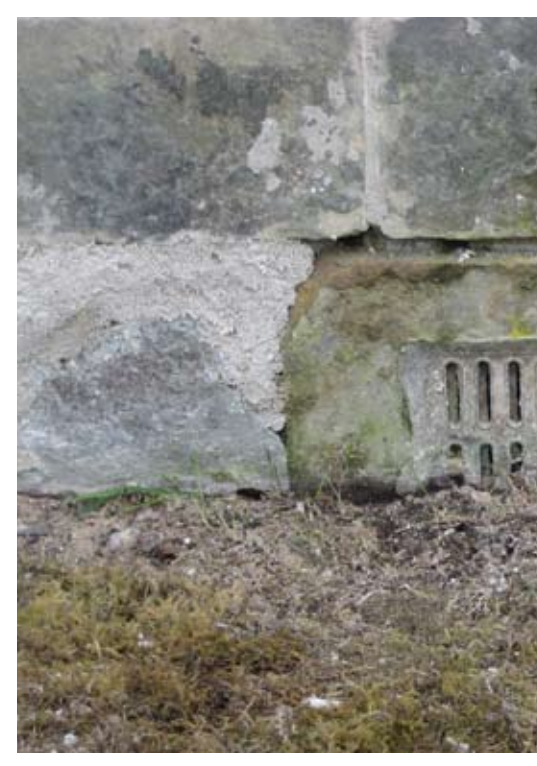
Despite recent masonry work to the elevation, this sub floor vent ha

There is evidence to suggest that poor ventilation can aggravate respiratory diseases and reduce general quality of life of the occupants. This INFORM guide will consider ways to ensure such movement is maintained and consider the various components that make up an appropriate ventilation regime for a traditional structure.