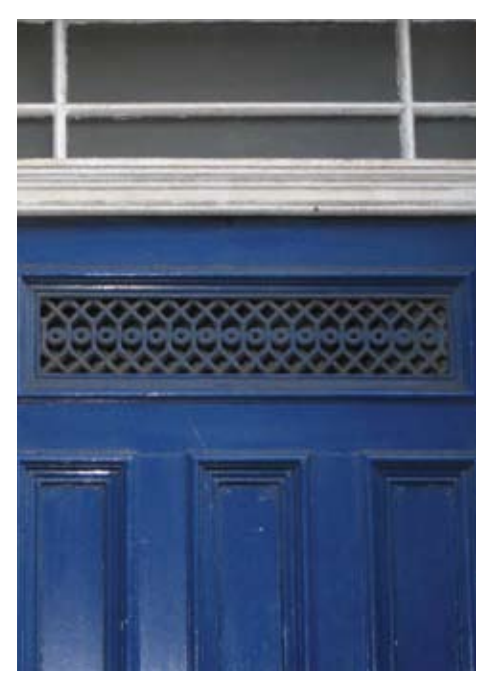
Ventilation grille in a late 19th C tenement door.