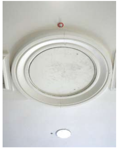
A decorative air vent at the top of 19th C stair.

When planning re-slating works, ensure that there are gaps between the new sarking boards (traditionally referred to as a "penny gap"). These, gaps, when used in conjunction with a breathable roofing paper, will allow sufficient ventilation to prevent condensation in the roof space. Some manufacturers will provide calculations and guidance on roofing papers to ensure the humidity and dew point is designed properly.