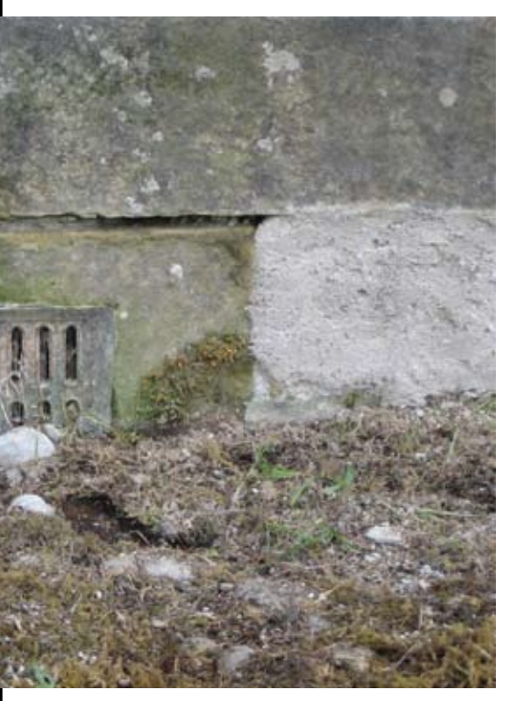
ined blocked; note also the risen ground level.