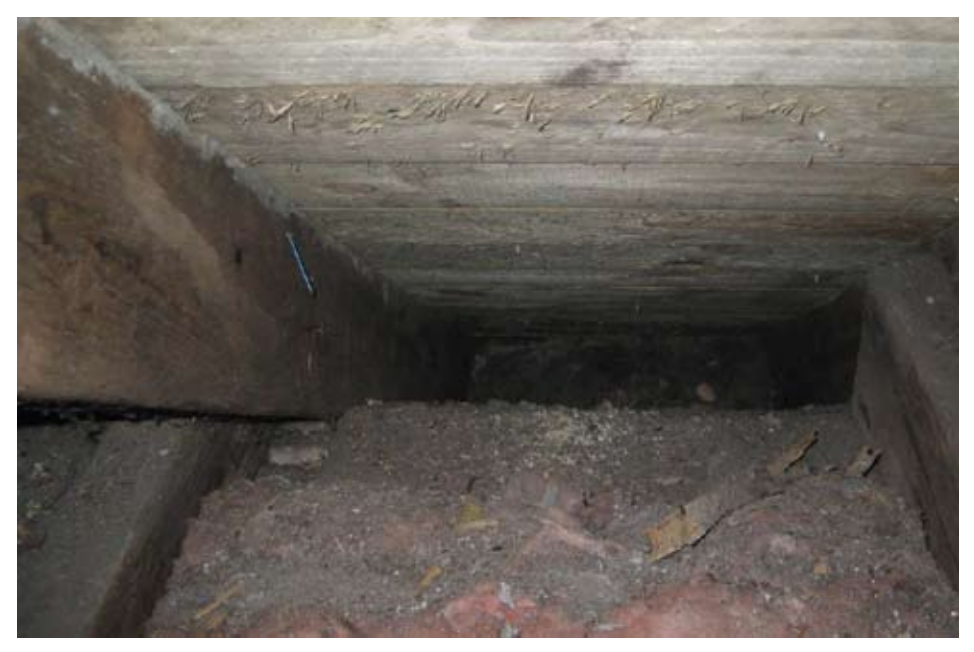
Fig 5. Loft insulation fitted, but the coombes are kept clear for air movement.