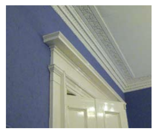
Hidden ventilation features in Randolph Crescent, Edinburgh – The pediment above the door admitted warmed air, and gaps in the cornice (now blocked) allowed it to be drawn away.

Although many households do not use wood or coal burning fires for heating, fireplaces and associated flues remain an important element in moisture control and ventilation generally. Regardless of status, most hearths and flues should be kept open, and if not in use, the chimney capped with a well ventilated cowl. Working chimneys assist in drawing out any moisture from the wall core, especially from exposed weather facing gables where water often penetrates. Deposited combustion products within the chimney tend to be hydroscopic and will absorb moisture from the air; for this reason alone an airflow should be maintained. From the mid 19th C cast iron grates were fitted with a hinged iron plate that could be closed shut when the fire was not in use; where this is not available the common solution of a bung of newspaper or rags is sufficient to prevent draughts, but allows some air movement.